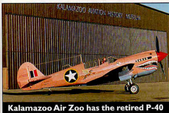
Kalamazoo Air Zoo has the retired P-40