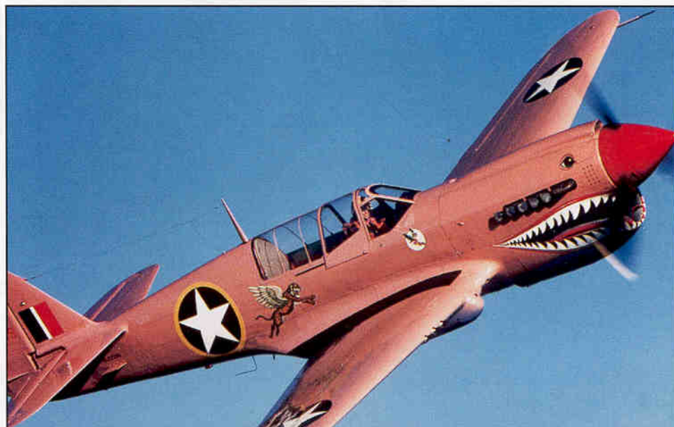
The Curtiss P-40N Warhawk attended Oshkosh annually for over 20 years.